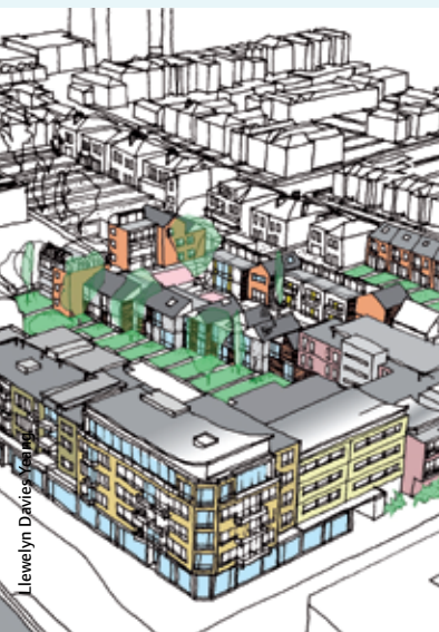
Llewelyn Davies Young

A new type of audit is recommended - the quality audit - where auditing for safety forms but one component. Safety is of paramount importance, but safety-related issues need not dominate the overall assessment of the scheme at the expense of other audit considerations.