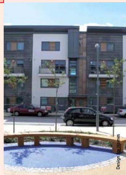
Design for Homes

Parking can be allocated to individual properties (in-curtilage or otherwise), but unallocated parking provides a common resource that helps to ensure space is used efficiently. Footway parking should be avoided.