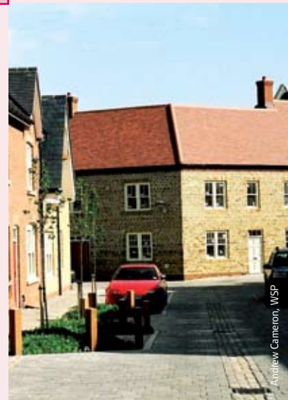
Andrew Cameron, WSP

Connected street networks will generally eliminate the need for drivers to make three-point turns, but sometimes cul-de-sacs may be required to make the best use of land available. If so, turning spaces should relate to their surroundings, not specifically to vehicle movement requirements.